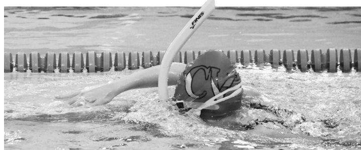
Thank you to all who have helped to make Chenango Valley Athletics off-season programming possible for our students! Pictured above is a student taking part in mini camp workouts during Phase III.

See more information: www.cvcasd.stier.org