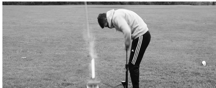
As part of a fun project during their projectile motion unit, Mr. Lewis's physics classes tested air-powered rockets.