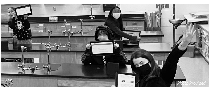
Sixth grade ELA students worked very hard to complete narrative essays. During writing celebrations on October 30, students were given the opportunity to share their essays with their classmates in a fun and interactive way!